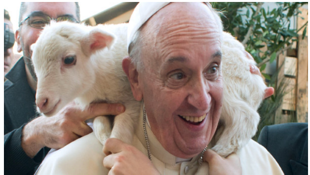
Pope Francis's message for the 55 th World Day of Prayer for Vocations.

May our Blessed Mother Mary, the young woman from the periphery, who heard, welcomed and lived the Word of God-made-flesh keep us and accompany us at all times along our path.